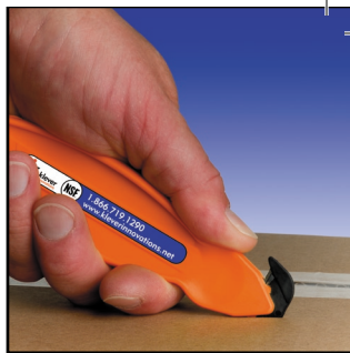
Opens many types of packaging