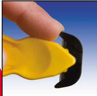
Recessed blade is finger-safe